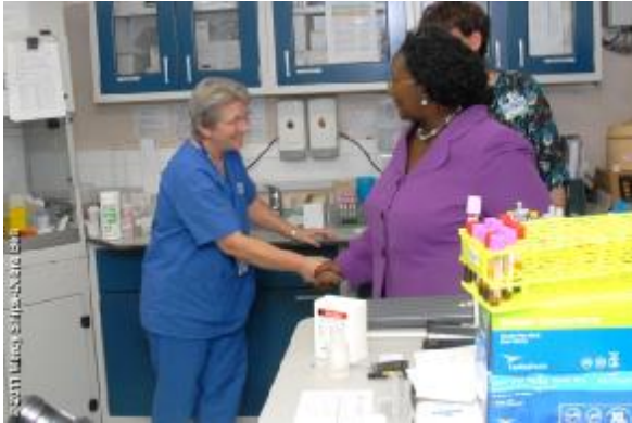
Greeting the First Lady of Sierra Leone

One of the things you soon find out about being on the Africa Mercy is that we have a lot of visitors to the ship. We've had a Medical Reception where leaders of the local medical community came aboard and a Civic & PR Reception where some of the local government & communications leaders were here. And periodically we have VIP visitors as well as those from local ministries. Often these visitors make at least a cursory visit to the lab and we get to meet them.